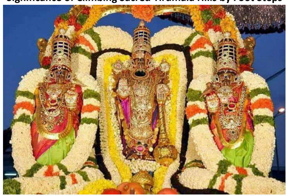
T.V.R. K. Murthy

T.V.R.K. Murthy's spiritual books can be downloaded free of cost from the following websites: