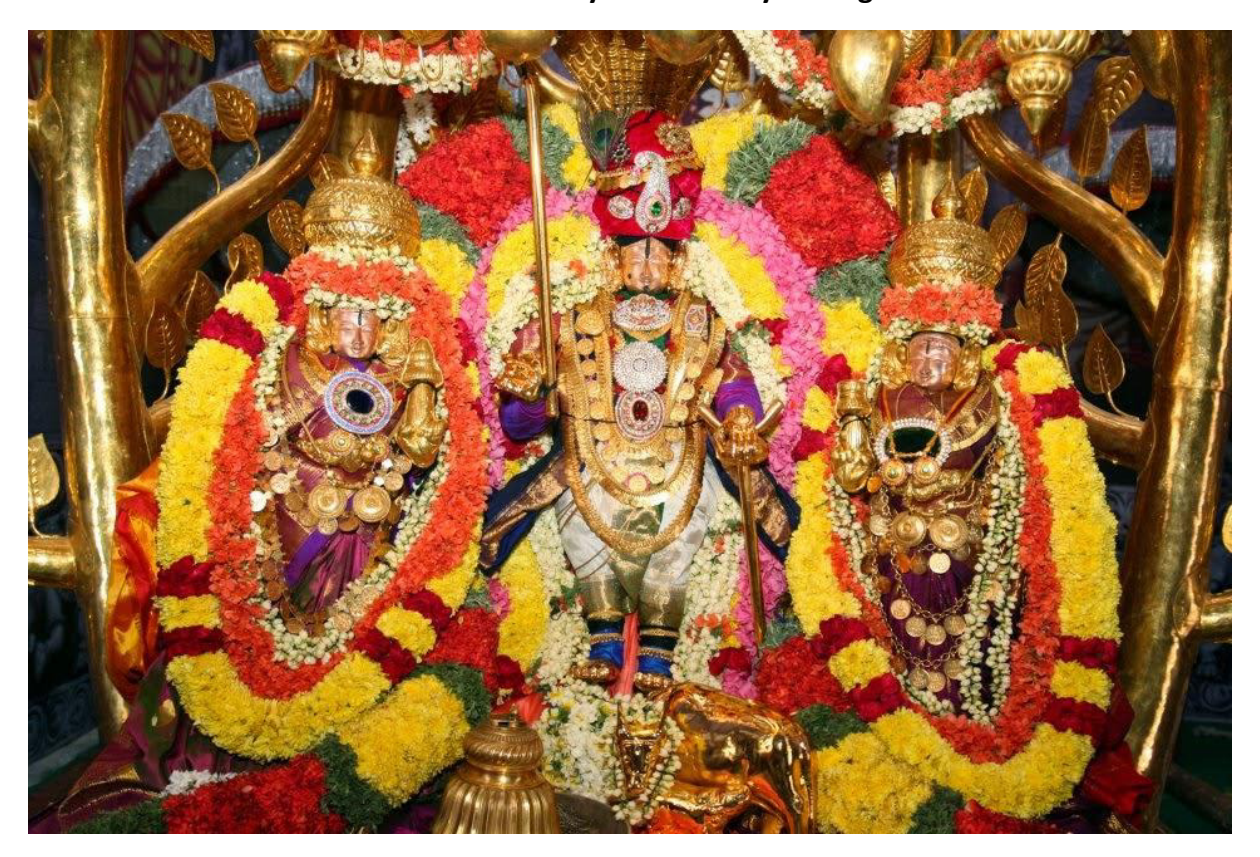
Samastha Sanmangalami Bhavanthu Lokaasamastha Sarve Janaa Sukhino Bhavanthu